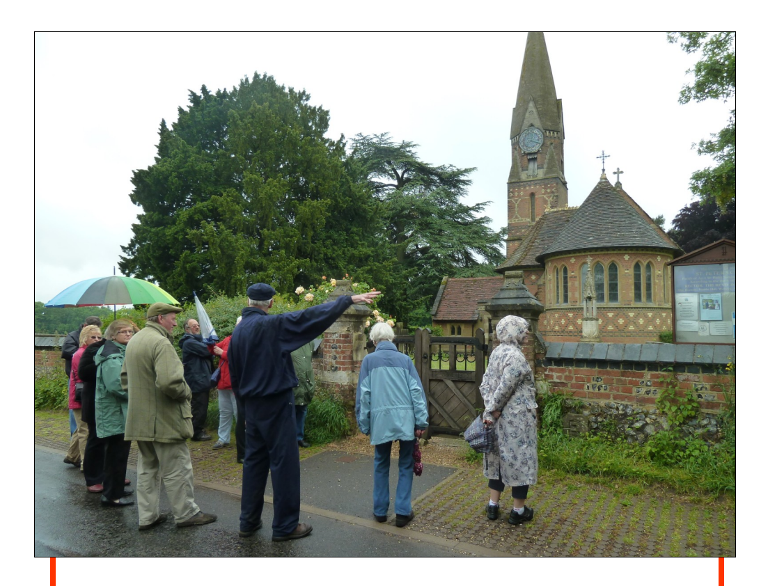
Contrasting weather for the Lemsford Walks in June and July, see page 5