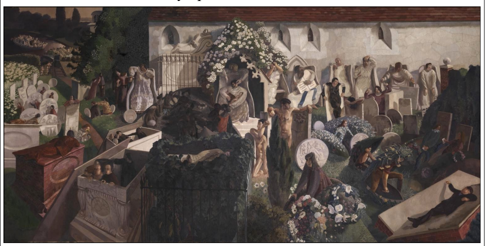
Sir Stanley Spencer, 1924-27 Tate Britain